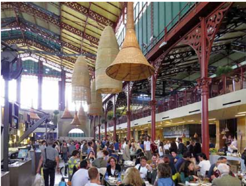
SAN LORENZO MARKET AND TUSCANY'S TASTE AND FLAVOURS

Other wines from the area are Pomino, which has been appreciated since the beginning of the 1700s, and which owes its name to one of the smallest DOC vineyards in the world, and Vin Santo, which was already known in the fourteenth century, and which is closely linked to Florentine hospitality. The people offered it to guests accompanied by the traditional cantuccini biscuits.